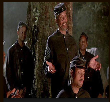
Soldiers Of The 54th Regiment

As they prepare themselves for the following day's battle, the soldiers of the 54th Regiment MA Vol Inf. (One of the first all-black regiments in the Union Army) gather around the campfire and sing praises to God.