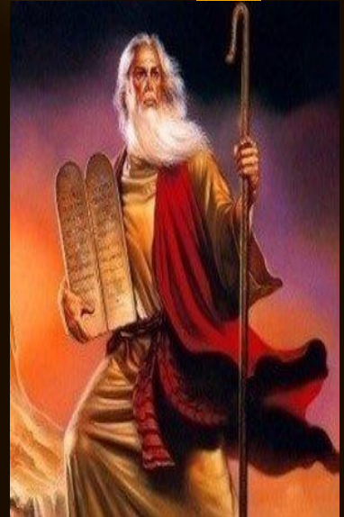
The Prophet Moses