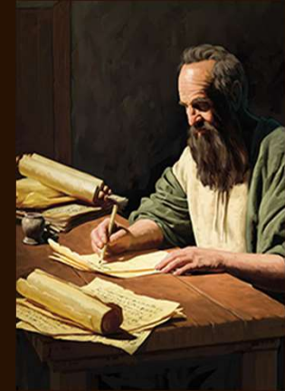
The Apostle Paul