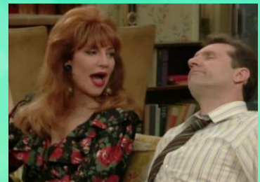
“Married With Children”

“Trust in the Lord with all your heart and lean not on your own understanding; in all your ways submit to him, and he will make your paths straight.” (Proverbs 3:5 – 6)