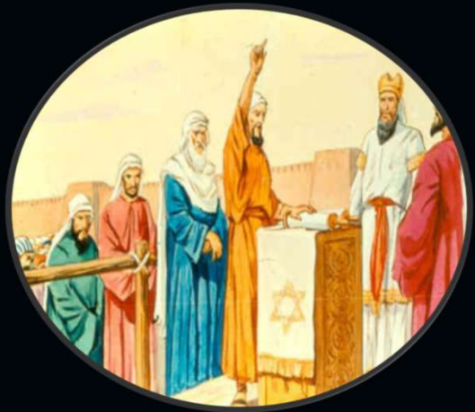
Nehemiah, The Leaders And The People Recommit To God And The Temple