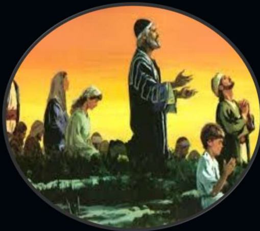
The Jews Confess And Repent Of Their Sins To God