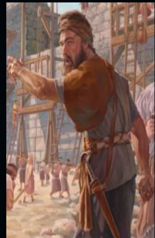
Nehemiah - Governor Of Jerusalem