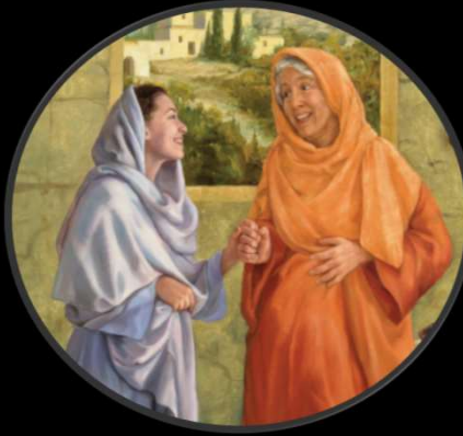
Mary Visits Elizabeth – Sharing The Joy Of Miracle Of John The Baptist & Jesus.