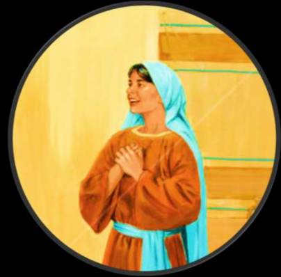
Mary Sings Her Song of Praise To The Lord "The Magnificat"