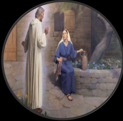
Gabriel Visit Mary With The News She Will Be The Mother Of Jesus