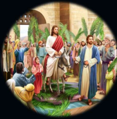
Jesus Triumphant Entry Into Jerusalem