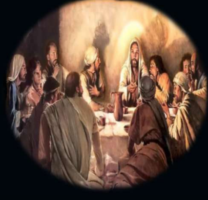
Jesus Celebrates His Final Passover With His Disciples.