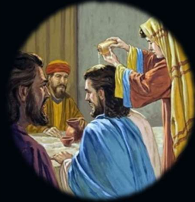
Jesus Anointed At The Home of Mary, Martha And Lazarus In Bethany