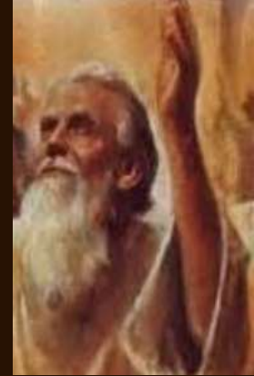
The Prophet Joel