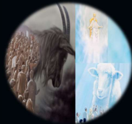
Jesus Gives The Olivet Discourse – Ending with the Sheep and Goats Parable