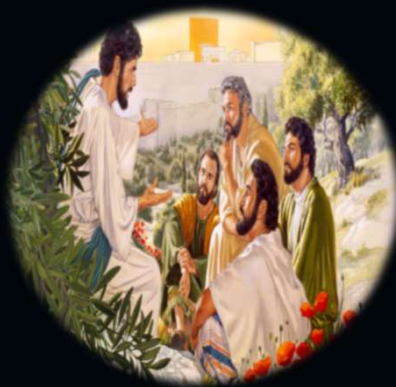
The Disciples Ask Jesus About Future Events on The Mount of Olives