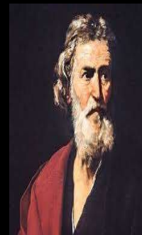
The Apostle Matthew