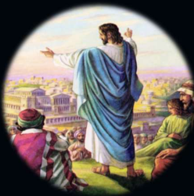
Jesus Prophesies The Destruction of the Temple in Jerusalem